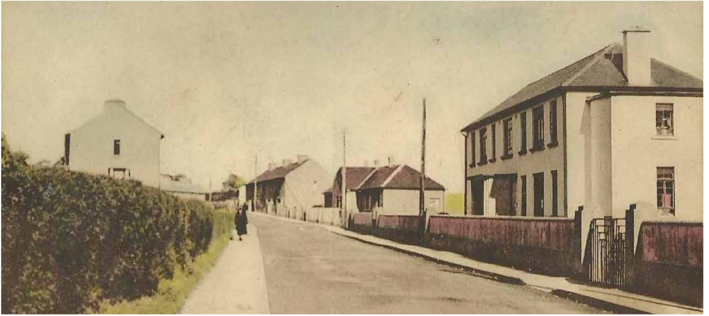
Opening of New Building