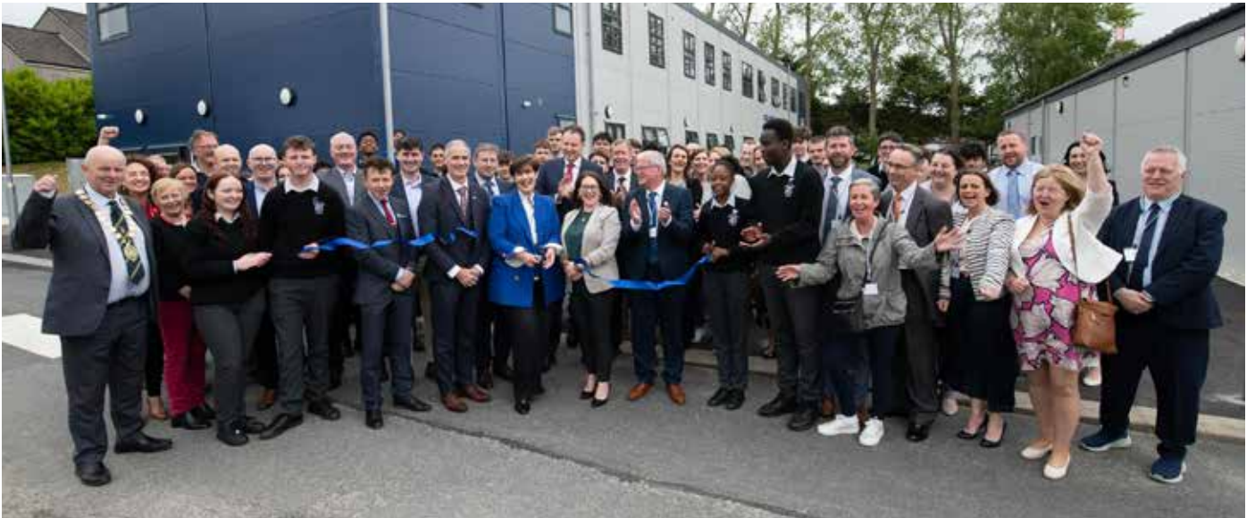
Errigal College Staff 2025